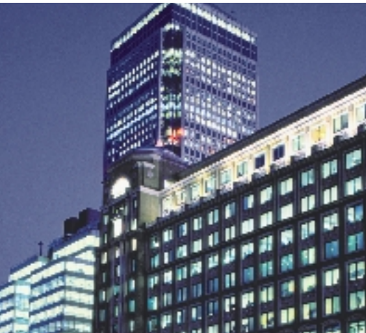
50% of electricity usage in office buildings comes from lighting.

The GreenLight Programme is an initiative of the European Commission. The aim is emitting less greenhouse gasses by systematic energy saving in lighting by companies and authorities. Participants in the GreenLight Programme, the GreenLight Partners, can show that they are making efforts for the environment. Participating means "promising to apply energy efficient lighting systematically". The promise is subject to the condition that the investment is cost-effective and that it improves the lighting. Participating in the programme does not require any legal commitment or financial contribution.