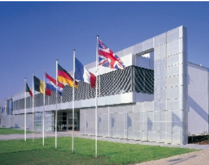
Experience for yourself the advantages of ETAP Lighting in our Light Pavilion.

As Main Endorser of the GreenLight Programme we are able to give you effective guidance as a GreenLight Partner or prospective GreenLight Partner. ETAP has had over fifty years experience in professional lighting projects. Our specialists can produce the ideal lighting solution for any situation. We prepare light calculations with impressions of the space to be lit. Using AutoCAD we plan where luminaires can be best sited. We calculate for you the operating expenses and cost-effectiveness of the chosen solution. If required we can build a prototype or carry out energy measurements. ETAP high efficiency luminaires, in which high reflection aluminium is used, provide optimum lighting comfort. The lighting control system based on daylight ELS (ETAP lighting control system), or the lighting control systems based on movement, MDD (Movement Dependent Dimmer)and MDS (Movement Dependent Switch) and the local lighting control system CONTROL-it™ guarantee minimum energy usage with maximum comfort. Visit our Light Pavilion and experience for yourself the advantages of ETAP Lighting in the different display areas.