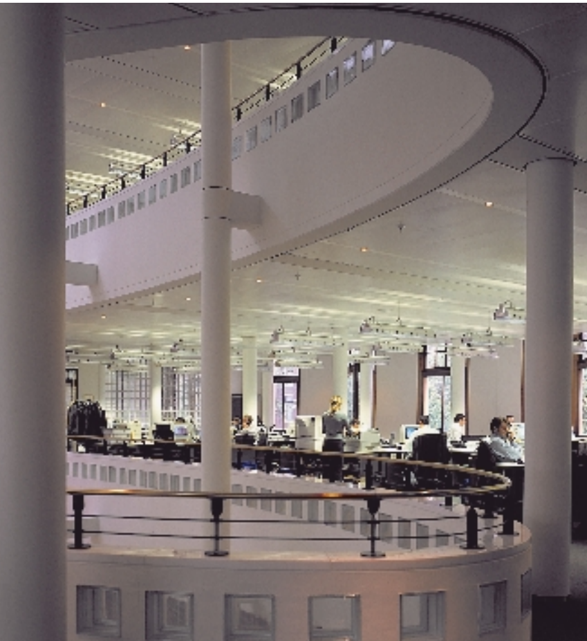
Ambience and comfort thanks to optimum lighting solution.