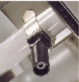
The ELS sensor.