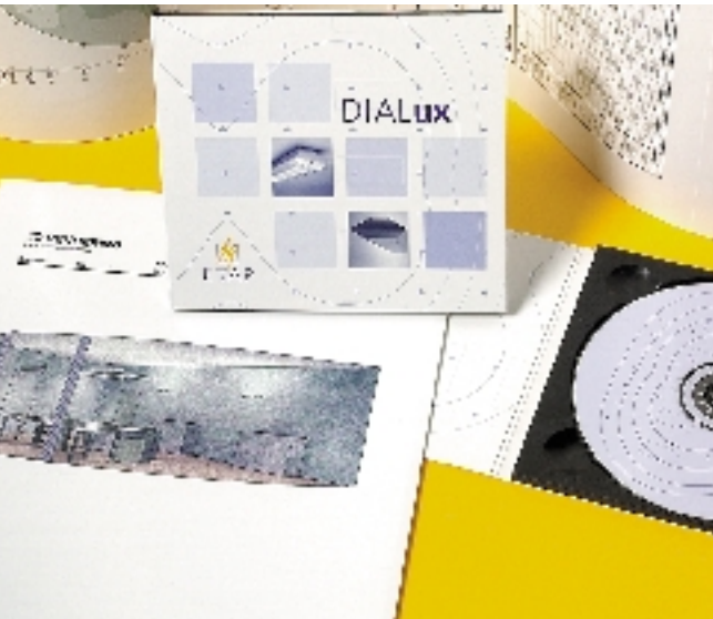
A light calculation with an impression of the space to be lit.