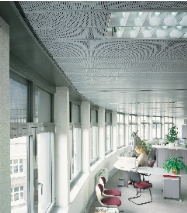
Saving energy using the ETAP daylight dependent lighting control system ELS.