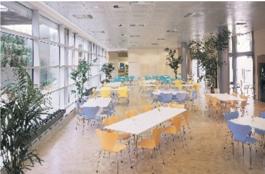
Energy saving lighting possibilities.