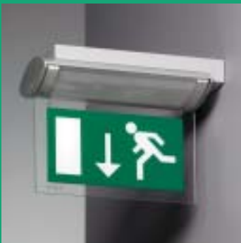
Right angle on the wall