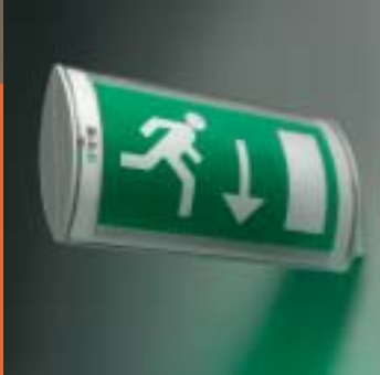
Square wall mounting, single-sided signage