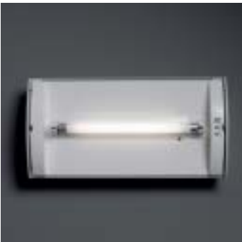
Fluorescent lamp 6W

Both 6W and 11W fluorescent lamps can be used in K1. Within the same housing a light source can be selected to meet specific requirements.