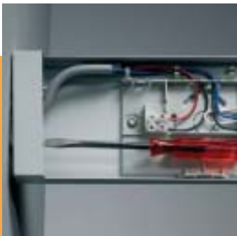
Adjust for uneven walls