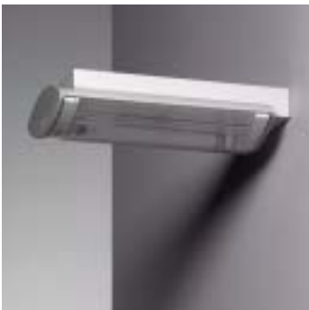
Right angle on the wall