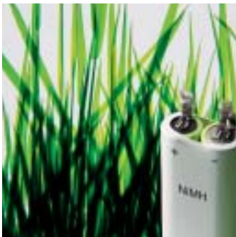
Environmentally-friendly NiMH batteries for non-maintained models