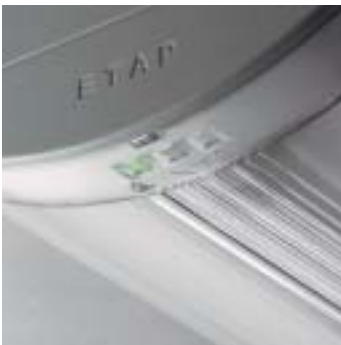
EST+: differentiated error messages

The low-energy electronics mean the power consumption of the K1 is minimal. K1 luminaires for self-contained emergency lighting are fitted with Nickel-Cadmium-batteries (NiCd). Non-maintained models can be fitted with nickel-metal hybrid-batteries (NiMH). They have an efficient charging process. One recharge period of a maximum of one hour a day suffices. The fact that the batteries are not overheated during the charging process significantly increases the life of the batteries. Also, the NiMH are more compact and don't contain any cadmium, making them more environmentally-friendly. There are also the single sided illuminated safety signs with LEDs which, in addition to a low power consumption, have an expected lamp life of 10 years.