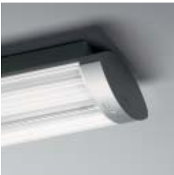
Aluminium RAL 9006