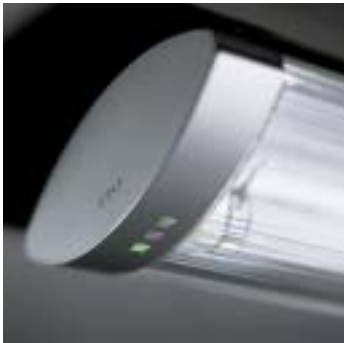
Decorative end piece

K1 uses modern and environmentally-friendly technology. ETAP has developed new electronics that meet European standard EN 50172 and IEC 62034 for the EST and EST+ automatic self tests.