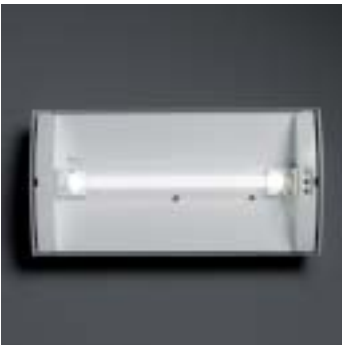
2 LEDs of 1W

The compact 6W fluorescent lamp is energy-efficient and has good colour rendering properties. This lamp can be used for maintained and non-maintained lighting and signage applications.