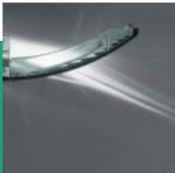
Wide angle Fresnel

In these models a special Fresnel lens provides a uniform and clear illumination of the sign and a light level of 5 lux on the floor with a mounting height of up to 4 metres. The plexiglass plate – hung on transparent hooks – swings out making it very sturdy and vandal-resistant. This pictogram is also easy to change.