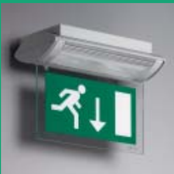
Parallel wall mounting