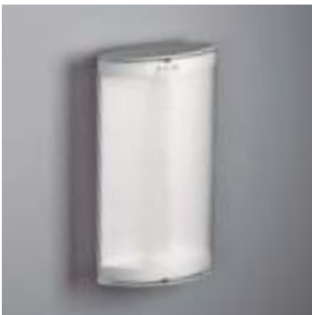
Diffuse wall mounting