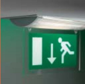
Recessed, double-side signage