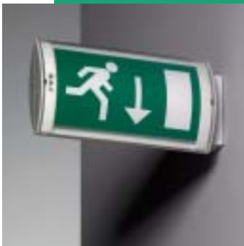
Right angle on the wall