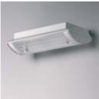
Parallel wall mounting