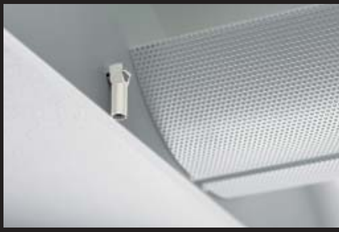
Saving energy with ETAP's ELS light control system