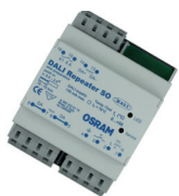
DALI repeater DIN – C3N01