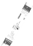
DALI converter DIN – C3N03